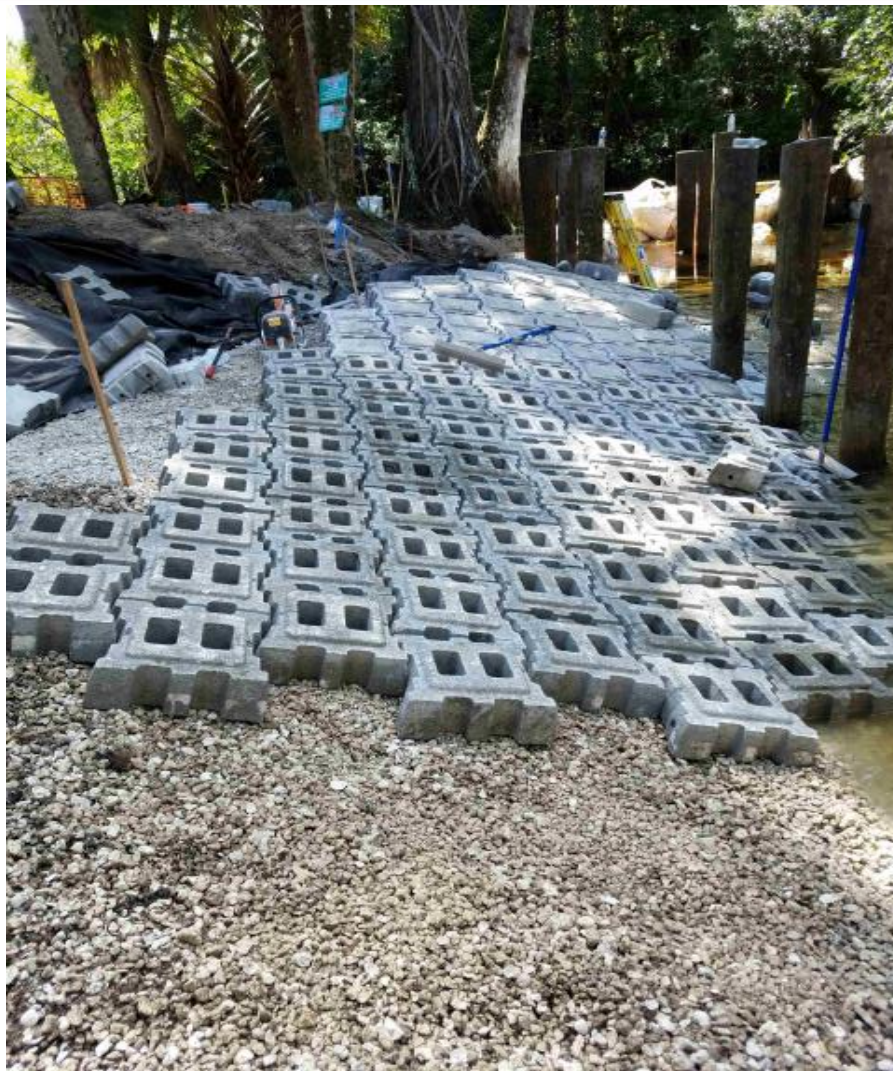
Articulated block placement – July 2017