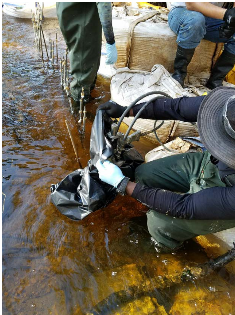
Uretek injection upstream of the Lainhart Dam Sept 2017