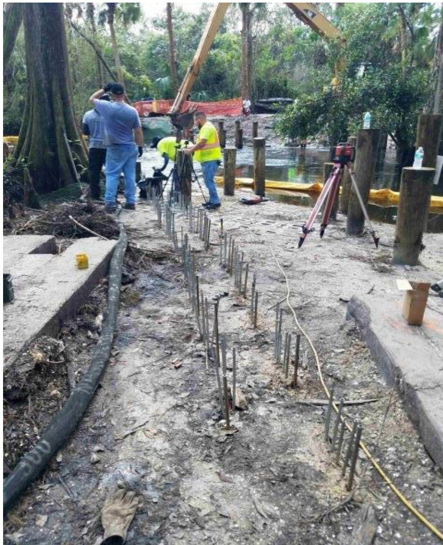
Uretek injection tubes on the West side of the Lainhart Dam Sept 2017