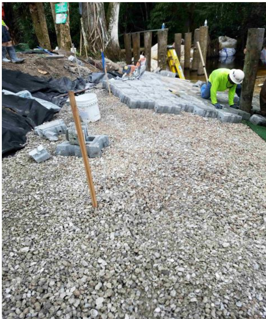
Articulated block placement – July 2017