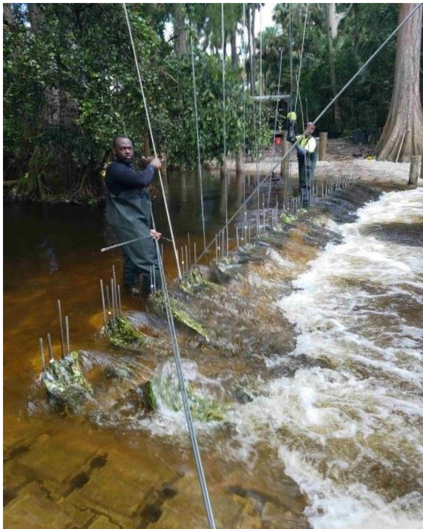
Uretek injection tubes Sept 2017