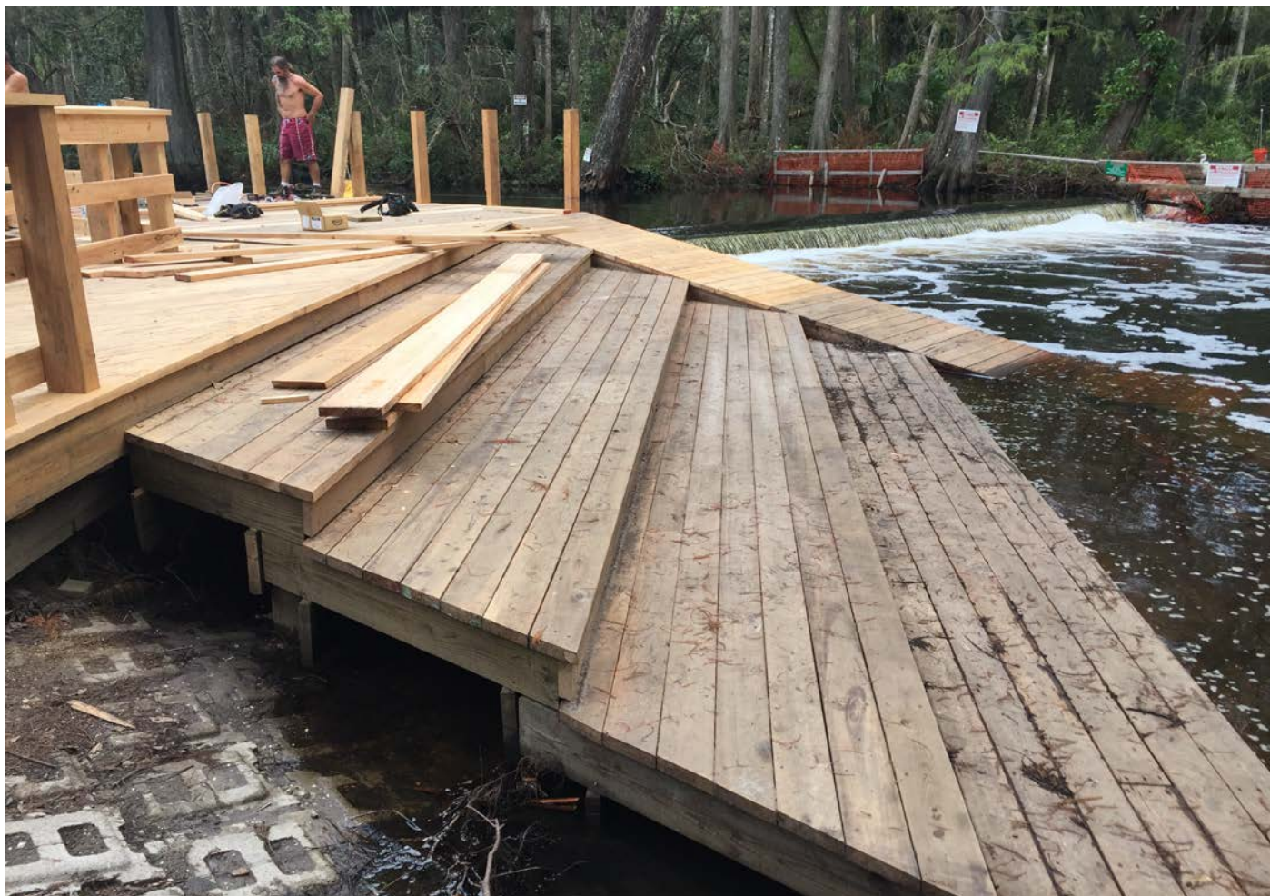
Portage and benches downstream side – Sept 2017