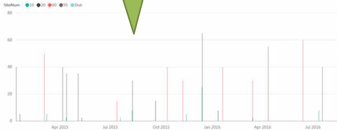
Average Result for Selected Analyte, Year and Station