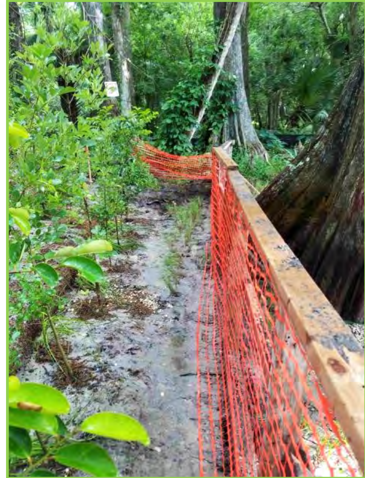
Alluvial area shown with new plants