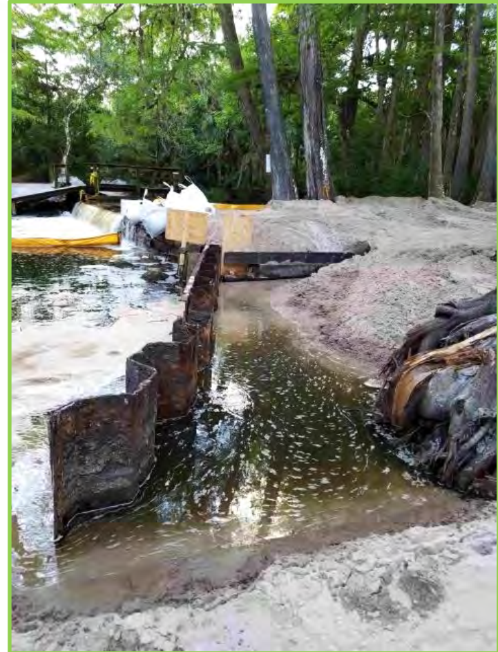
Earthen dam built to start construction at Masten Dam