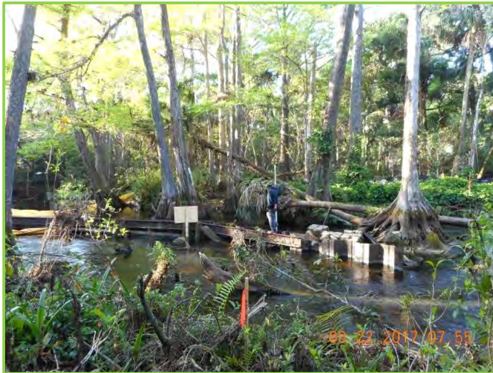
West side of Masten Dam, looking at the bypass channel