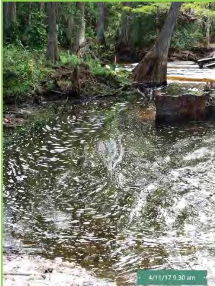
Debris has been removed on the West side of Masten Dam