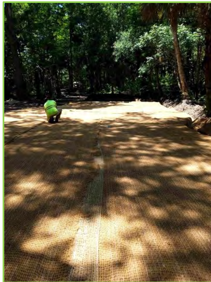
VRSS construction and articulated block placement