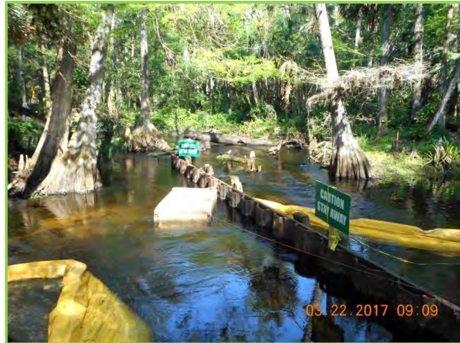
Old cap and cypress logs removed