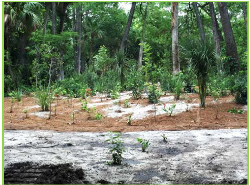
Alluvial area plantings in place