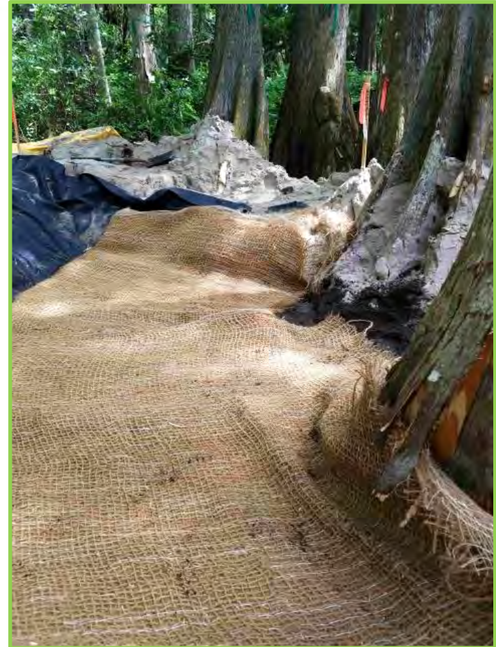
Installing blankets in Alluvial area for the VRSS