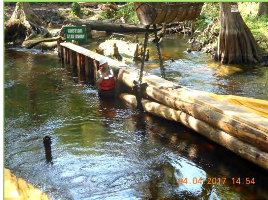
Installation of cypress logs on upstream side of Masten Dam