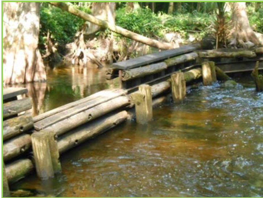
Original Masten Dam