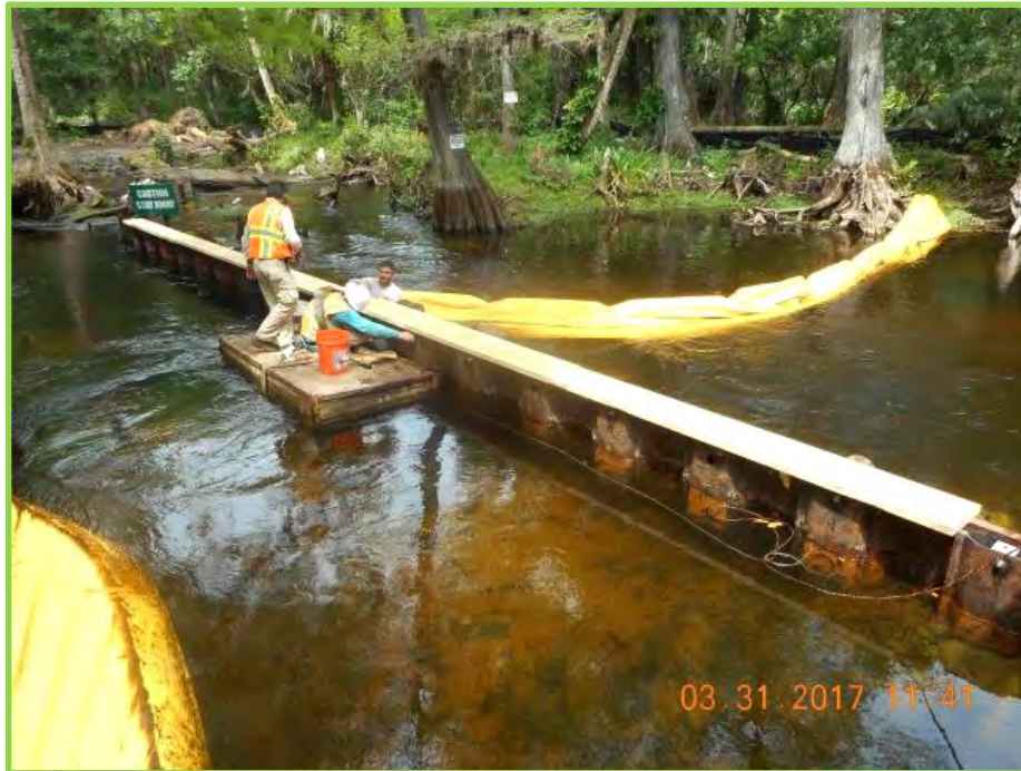
Installation of weir cap and cypress logs at Masten Dam