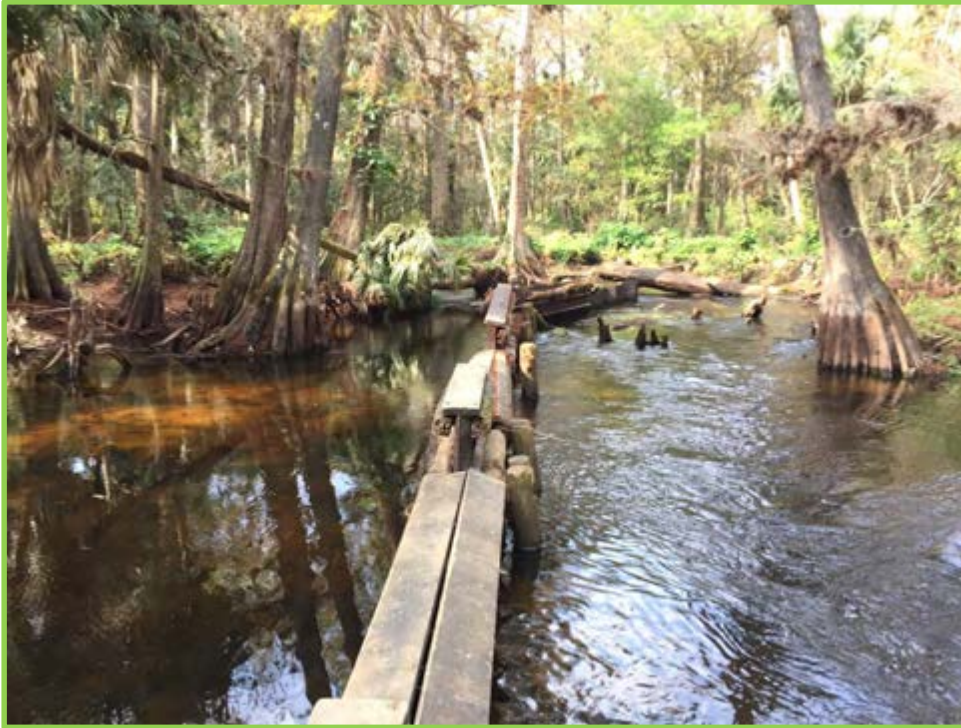
Original Masten Dam Above

New cap and cypress logs installed, water flowing over new cap